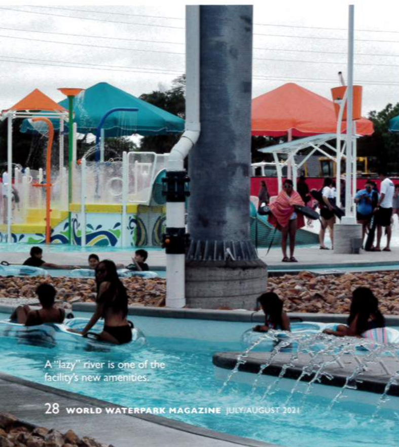
A "lazy" river is one of the facility's new amenities.

had the opportunity to swim in The Big Pool after it closed for the season. Crowds reportedly came from as far as California and numbered in the thousands daily for the week that the elephants swam.