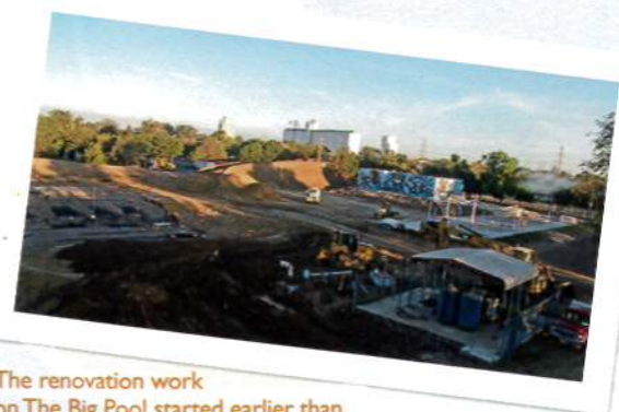
The renovation work on The Big Pool started earlier than expected in 2020 due to the pandemic.