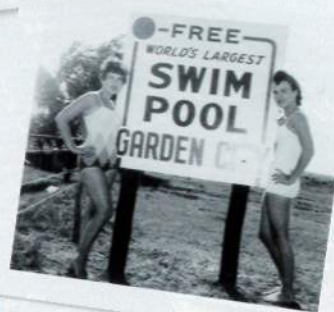
Opened in 1922, The Big Pool was available free of charge until 2003.

Lansing, Michigan, would travel to Garden City to perform in the pool. The 1960s would have visitors from every state recording its largest attendance record for the season. The 1970s was the beginning of the bathtub races, which was a fundraiser for Muscular Dystrophy. During the 1980s, a local resident taught wind sailing classes in The Big Pool. Then, from 1987 to 1994, the beloved elephants Moki and Chana from the City's Lee Richardson Zoo