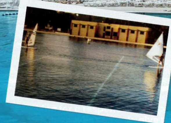
During the 1980s, wind sailing classes were taught at The Big Pool by a local resident.

GARDEN RAPIDS AT THE BIG POOL IS A UNIQUE COMBINATION OF NEW AND MODERN AMENITIES WITH MEMORIES OF THE PAST SPRINKLED THROUGHOUT THE FACILITY.